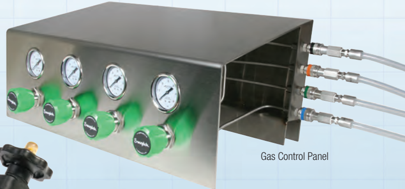
Gas Control Panel

All Sentinel fabricated parts include complete GMP style documentation including MTR's and C of C's