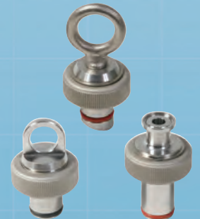
InGold Plugs and Ports