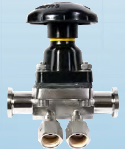
Diaphragm Valve Fabrications