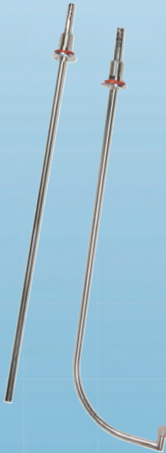
Sparge and Dip Tubes