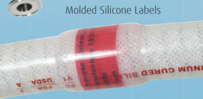
Molded Silicone Labels