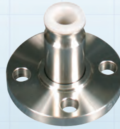
PFA Lined CAM Lock Adaptors

Sentinel uniquely serializes every hose assembly we fabricate in order to help you manage your production hose inventory. We also offer a variety of custom tagging and labeling options as well. Our engineers are ready to help you with all your flex hose applications.